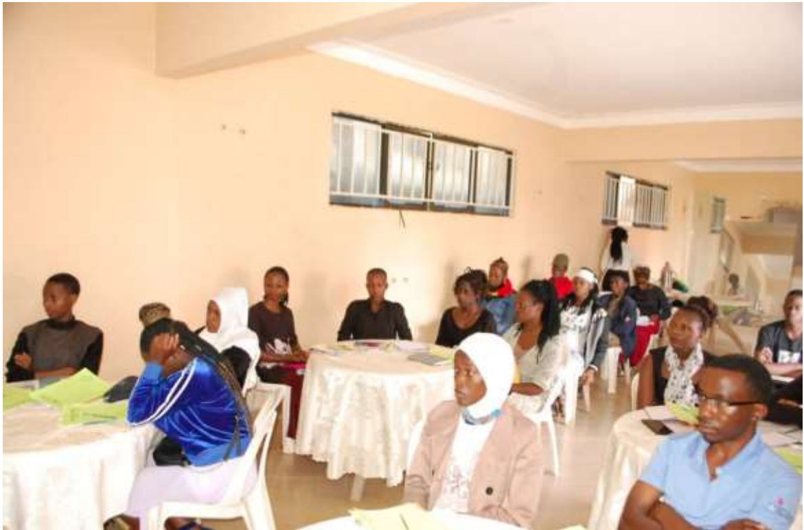
Figure 3: Taken from the recent IT Innovation Training workshop

technical person to manage their site on a daily basis. Website maintenance doesn't come very cheap and it comes as an added cost if one is to erect a website and ensure that it is up and running. Once you learn how to use the system you will have forfeited the cost of website designing which doesn't come very cheap either if you ask around. Online marketing and advertising today is taking the lead especially after the recent lesson of the effects of COVID19 to most world economies and businesses.